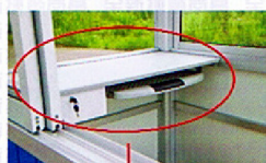
Built in computer table with key board drawer