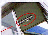
Built in flourescent lamp