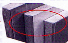
Insulated board construction